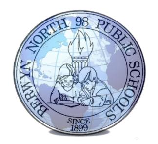
Berwyn North School District 98

Tel: (708) 484-6200 Fax: (708) 795-2482 www.bn98.org