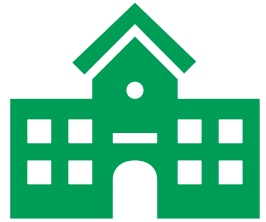
ALN 84.282B – Opening of New Charter Schools