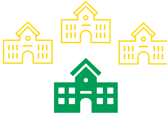
ALN 84.282E – Replication and Expansion of High-Quality Charter Schools