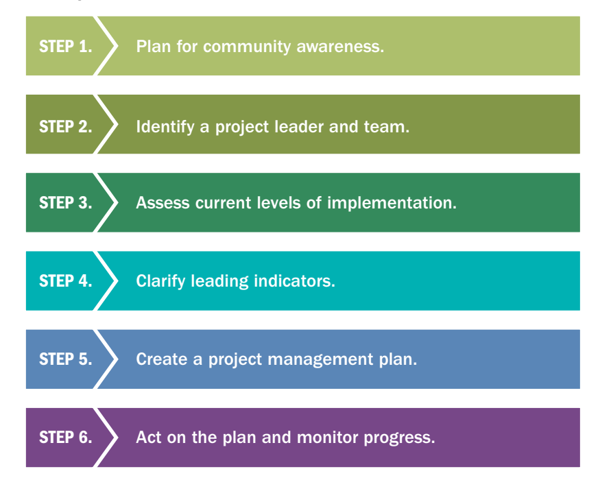
Figure 1. Planning for Robust Implementation