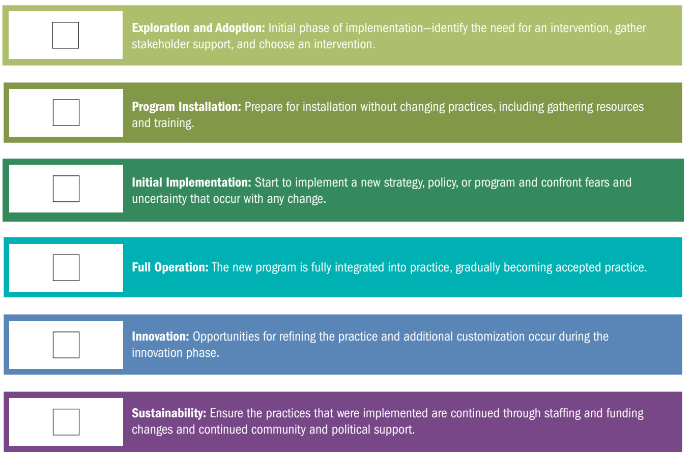
Figure 3. Stages of Implementation.

Leaders and stakeholders may use the stages of implementation (see Figure 3 [Fixsen et al., 2005]) to identify the preliminary levels of implementation for a given initiative or strategy. Then they can use the guiding questions and tool in Appendix C to gather information and identify current successes and challenges in the implementation of each policy initiative.