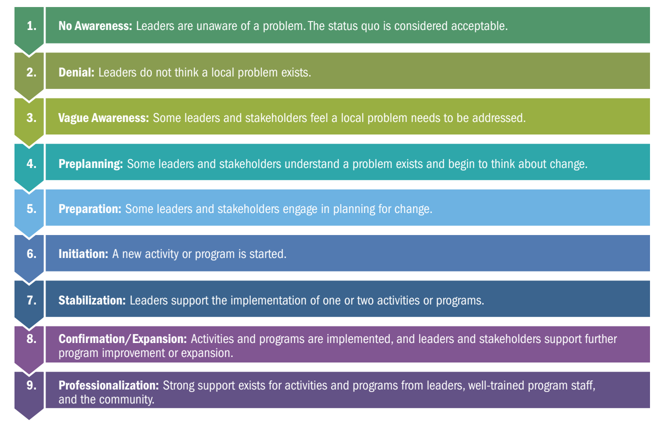
Figure 2. Stages of Community Readiness

The stages of community readiness are described in Fixsen et al. (2005). See Appendix A.